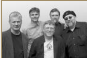
Gabriel 2004 grayscale 300 dpi | jpeg 582 kb

HI-RES IMAGES AVAILABLE AT www.southsoundpromotions.com/gabriel.htm