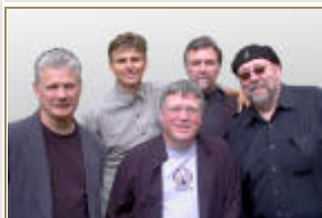
Gabriel 2004 color 300 dpi | jpeg 947 kb